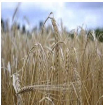
EU & UK Malting Barley Balance Crop 2020